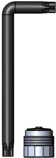
015588-40 (1) Adjustable Outlet w/ Hex Key