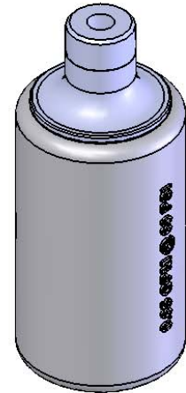
012665-45 Dow Corning 111 Silicon Grease Packet Qty (1)