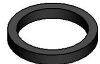
009306-20 Valve Stem Qty (2)