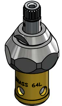
RTC Hot Cartridge