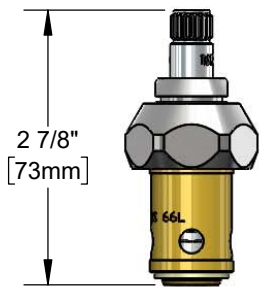
LTC Cold Cartridge