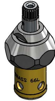
LTC Cold Cartridge