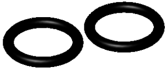
(2) Heat Resistant O-Rings