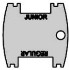
015425-45 Vandal Resistant Key