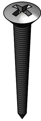
#12 Type A Phillips Head Fully Threaded Screw