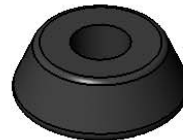
012596-45 Bottom Stem Seal (Qty 1)

Product Specifications: Repair Kit for 238A Metering Cartridge