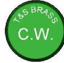
001191-45 Snap-In Color Index "CW" Dark Green (Qty 1)