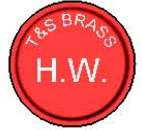
001194-45 Snap-In Color Index "HW" Red (Qty 1)

Product Specifications: 4-Arm Lab Handle Replacement Parts Kit