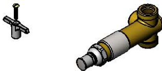
B-1027-UCP Concealed Straight Loose Key Valve w/ Tee Handle & Mounting Screw Qty. = 2 ea.