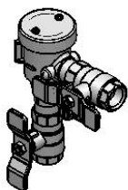
B-0963 Continuous Pressure Vacuum Breaker Qty. = 1 ea.