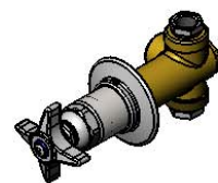
0RK2 Shutoff / Control Valve w/ Adjustable Wall Flange Qty. = 1 ea.