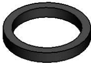
001040-45 Washer Qty = 4 ea.