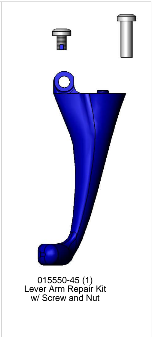
015550-45 (1) Lever Arm Repair Kit w/ Screw and Nut

Product Specifications: Glass Filler Repair Kit