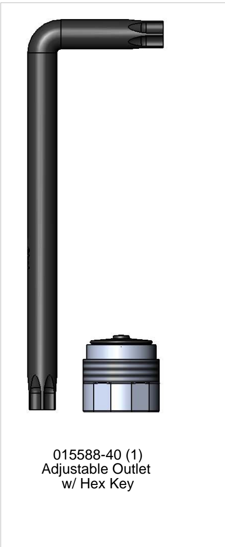
015588-40 (1) Adjustable Outlet w/ Hex Key